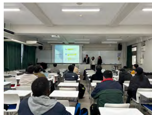
学生による発表及びグループディスカッション（左、中：地域環境文化特論 / 地球環境セミナーⅠ；右：環境ソリューション特別演習Ⅰ）