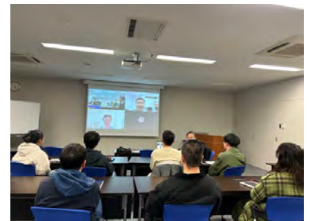
オンラインセミナーの様子 The scene of the online seminar

The seminar not only covered specialized topics related to solid waste treatment and soil contamination but also included introductions to their respective universities, expectations from these institutions, and discussions on career paths. Many students were seen taking notes attentively, making it a highly meaningful seminar.