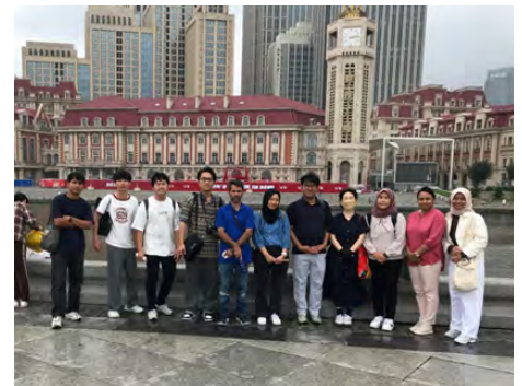
Photo after field survey at Tianjin Haihe