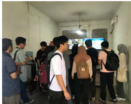
Yellow River water intake facility monitoring room in Sanjiao town