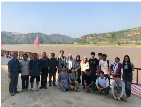
Group photo at the Yellow River old port, Sanjiao town, Liulin County, Shanxi Province